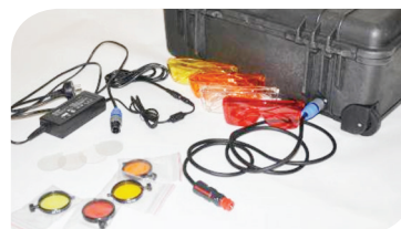
Accessories - Goggles, Car Charger and AC Charger