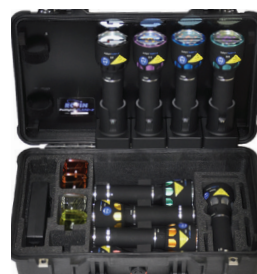
Battery Charger Cradles in the Carry case.

The beam is collimated with a 2-25° half angle divergence giving a superbly even light spot. In addition, a range of beam profile filters are available which can be clipped onto the front of the Flare® Plus2 head to create a wider divergence or a strip of light ideal for shoeprint visualisation. If you used the Polilight-Flare® Plus for 8 hours per day, 5 days per week, the LED light source would still be working after 25 years !