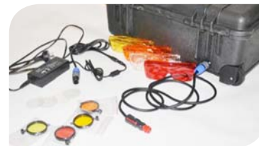
Accessories – Goggles, Car Charger and AC Charger