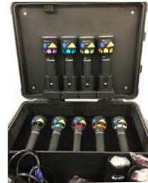
Battery Charger Cradles in the Carry case.

The beam is collimated with a 5° divergence giving a superbly even light spot. In addition, a range of beam profile filters are available which can be clipped onto the front of the Flare® Plus2 head to create a wider divergence or a strip of light ideal for shoeprint visualisation. If you used the Polilight-Flare® Plus for 8 hours per day, 5 days per week, the LED light source would still be working after 25 years !